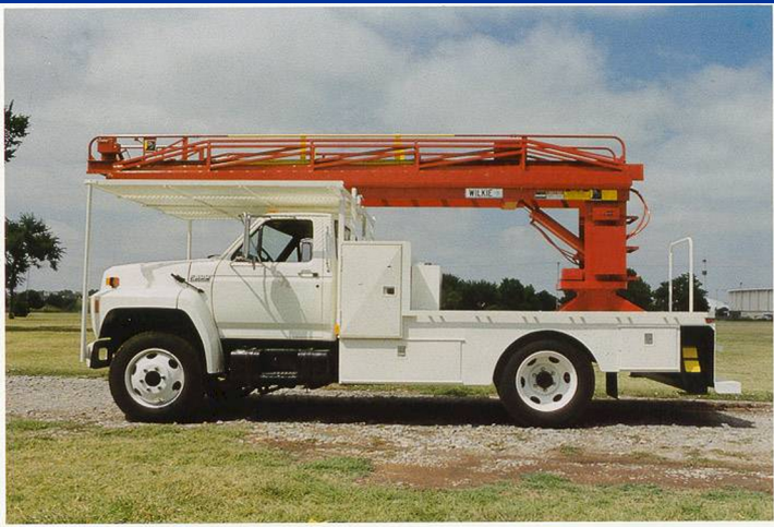
MODEL 60 LADDER ALL HYDRAULIC FIBERGLASS TOP SECTION

The Model 60 Ladder is the successful blend of design innovation and HI-Performance in an aerial ladder.