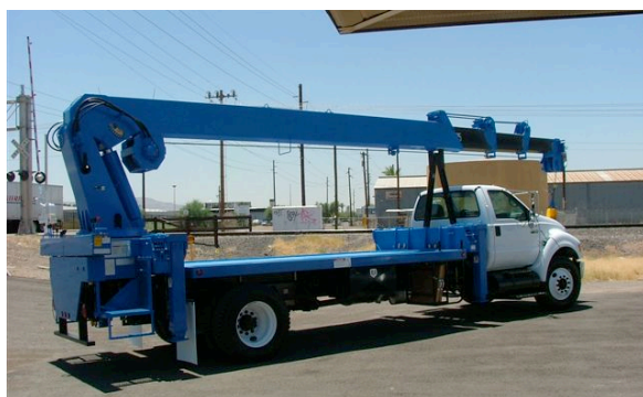
Rear Mount or Behind the Cab Mount