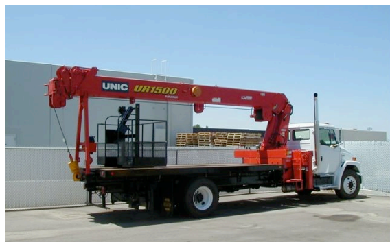
Capacity 30,000 lbs. - at 4ft