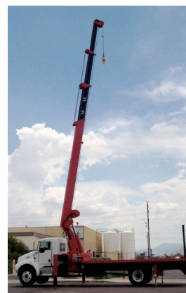
Boom Length 82 ft. - Retracted 25 ft.