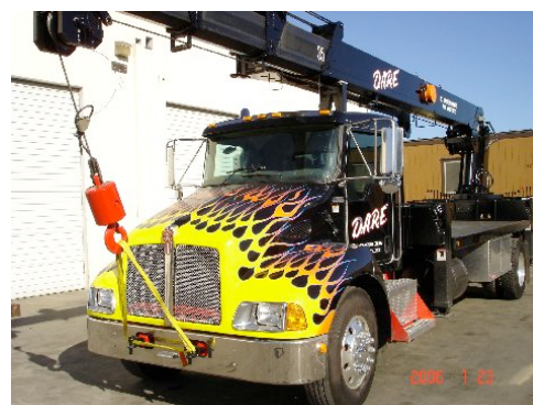
33,000 GVWR with Great Hauling Capacity

WORLD CLASS QUALITY FROM JAPAN. INDUSTRY DESIGN LEADER.