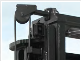
Forward activated alarm