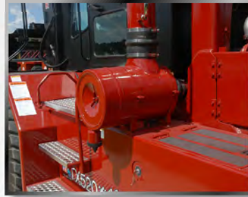
Dual element air cleaner with restriction indicator