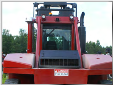
Unobstructed rear view The air snorkel and shielded exhaust are mounted on the corners of the cab to keep the view open.