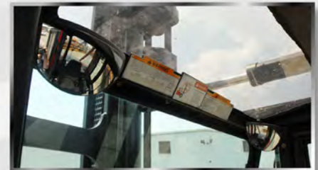
Dual panoramic interior rear view mirrors standard Dual external side view mirrors standard Optional pedestrian camera and monitor

This blend of ergonomics and technology will help your operator be more efficient with the job at hand... handling materials.