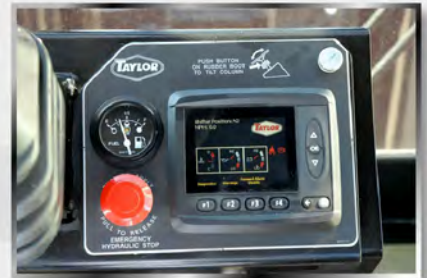
Easy to understand diagnostic display. TICS (Taylor Integrated Control System) using CANbus technology is standard on the TX Series.

The TXi Series features a spacious, all steel cab with increased leg and head room, sound deadening rubber mat flooring, tilt steering wheel, simple T-shaped dash with hinge down instrument panel, fingertip electric joystick controls, and optional climate control system for operator comfort and convenience.