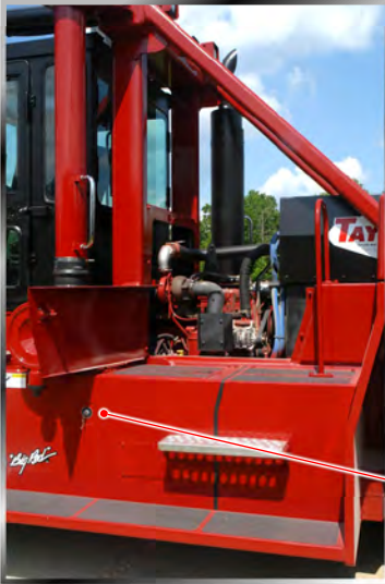
Battery cut-off switch