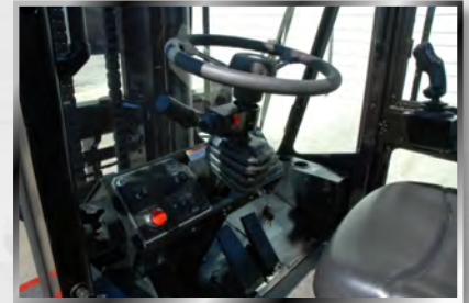
Spacious uncluttered cab with tilt steering, hinge-down dash, climate controls and adjustable seating Premium vinyl or cloth seat that rotates 15° left and 20° right