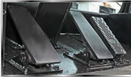
Two brake pedals left – brakes and inching right – brakes only