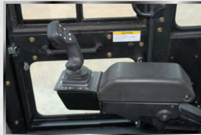
Comfortable adjustable arm rest with fingertip joystick control for smooth precise handling