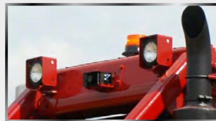
Overhead rear work lights for improved safety and visibility Key-switch actuated amber strobe light Reverse activated alarm