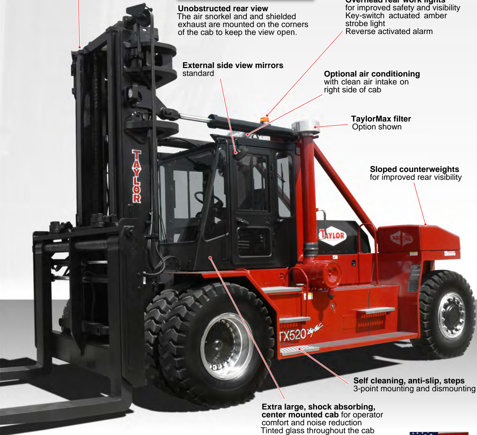
External side view mirrors standard