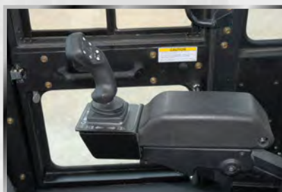
Comfortable adjustable arm rest with fingertip joystick control for smooth precise handling