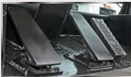
Two brake pedals left – brakes and inching right – brakes only