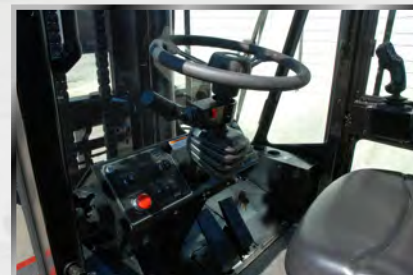
Spacious uncluttered cab with tilt steering, hinge-down dash, climate controls and adjustable seating Premium vinyl or cloth seat that rotates 15° left and 20° right