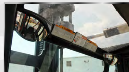
Dual panoramic interior rear view mirrors standard Dual external side view mirrors standard Optional pedestrian camera and monitor

This blend of ergonomics and technology will help your operator be more efficient with the job at hand... handling materials.