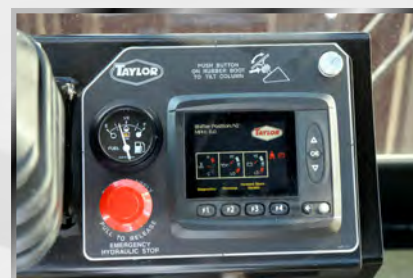
Easy to understand diagnostic display. TICS (Taylor Integrated Control System) using CANbus technology is standard on the TXH Series.

The TXH Series features a spacious, all steel cab with increased leg and head room, sound deadening rubber mat flooring, tilt steering wheel, simple T-shaped dash with hinge down instrument panel, fingertip electric joystick controls, and optional climate control system for operator comfort and convenience.