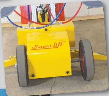
The SL 380 can be shifted sideways up to 100 mm for precision adjustment during the window installation process.