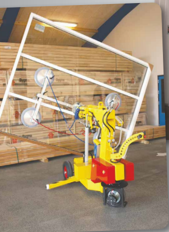
The lifting device has a multifunctional swivel head.