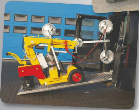
The Smartlift is easily transported in a van or on a trailer