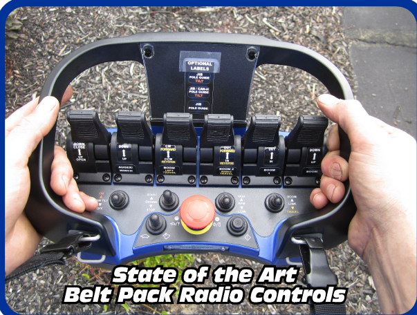
State of the Art Belt Pack Radio Controls