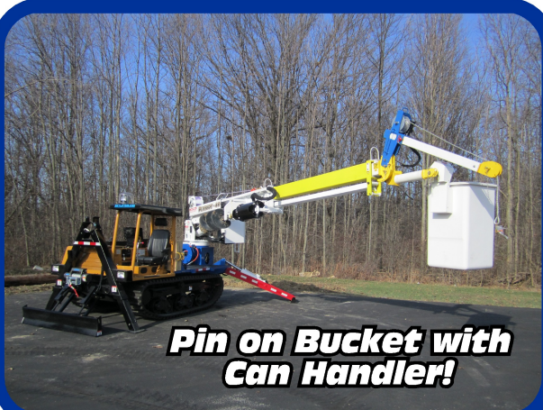
Pin on Bucket with Can Handler!