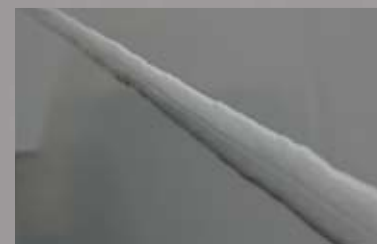
We fabricate our structures to ensure the highest quality of welding and workmanship.