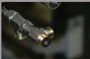
We use o-ring facing seals to prevent hydraulic leaks and blow outs.