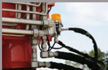
We wrap our hoses in Cordura covers to protect them from harsh elements and to protect the life of your investment.