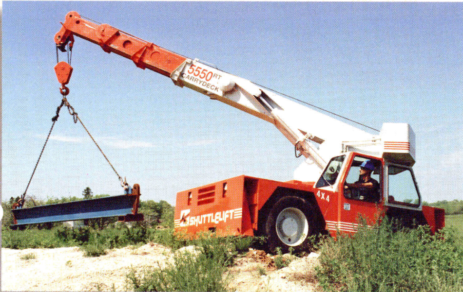
The 5550RT Carrydeck Crane