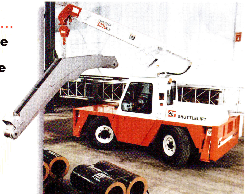
The 3330ELB Carrydeck Crane

Versatile, Productive Cranes for Complete Industrial Mobility