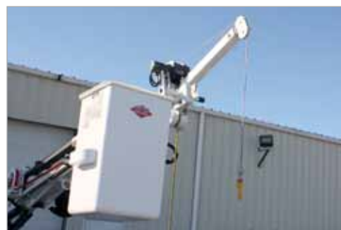
1,000lbs winch tip material handling