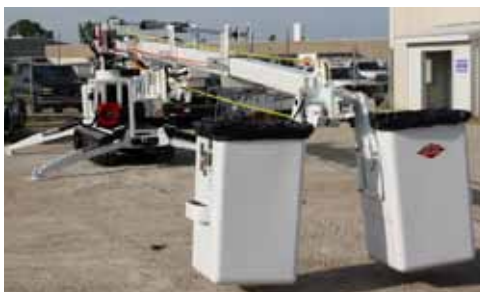
Buckets can be mounted on either side