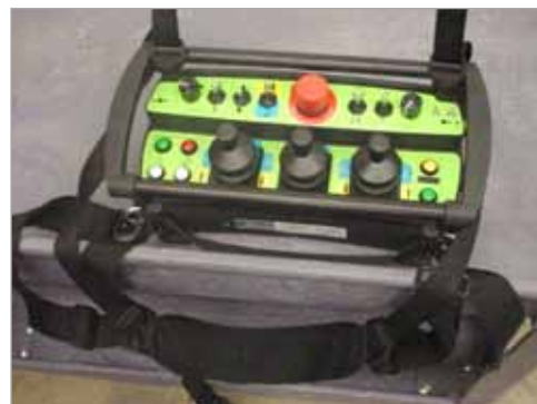
New style radio remote