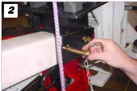
Secure jib with pin