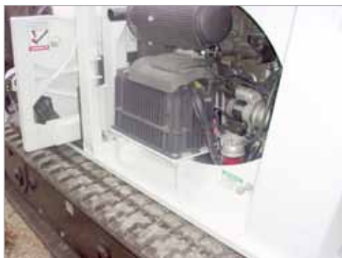
2,000 watt Inverter