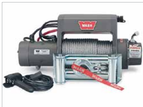
Recovery winch available