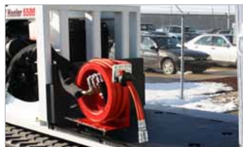
Hose reel available

Warning: Do not use in conjunction with main crane winch. Serious injury or death can occur