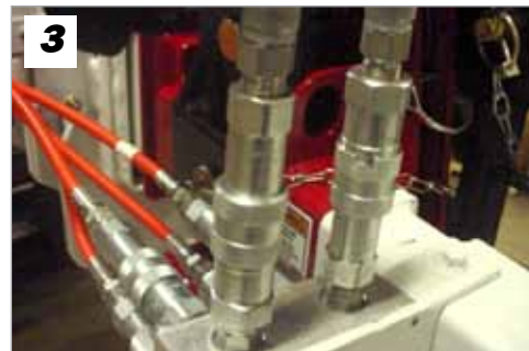
Attach quick couplers