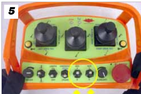
Use accessory toggle switches on the remote control to operate the material handler