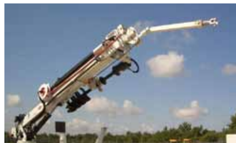
Phase adapter available

Contact Your Representative for More Information