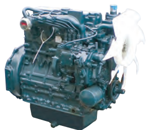
52-60 HP Kubota diesel engine