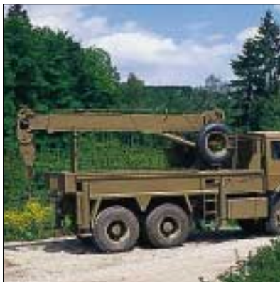
PK 31000 TW