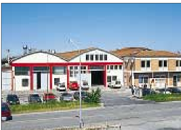
Cadelbosco di Sopra