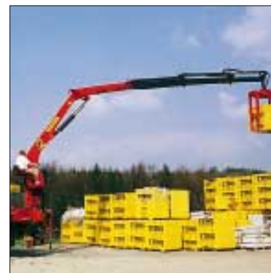
PK 19000 L