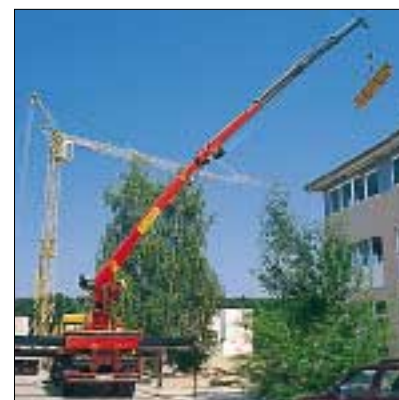
PK 30000 EL/33000 EL