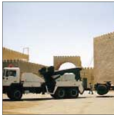
PK 55000 T