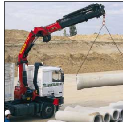
PK 24500/24001 USA