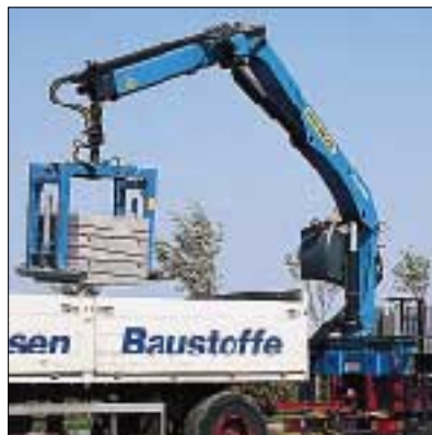
PK 16000 L