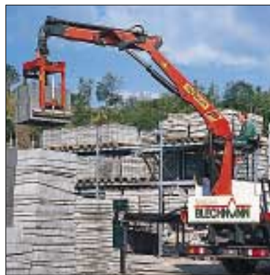
PK 13000 L