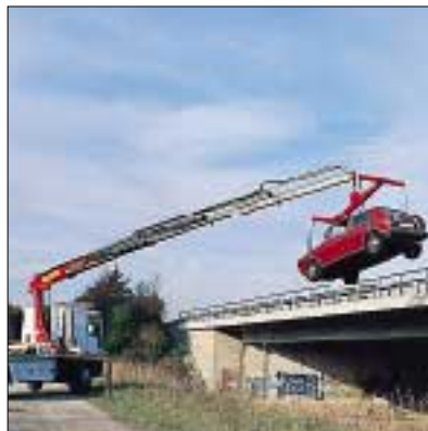
PK 8000 T/14500 T