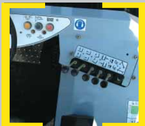
4-way mode enabled via hydraulic lever.