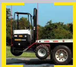
Truck-mount overhang of 52"