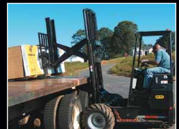
The CR 50 PALREACH unit will reach 45" across the bed