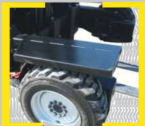
Hydraulic lumber support arm package.