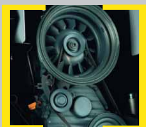
3 cylinder 47 HP diesel engine