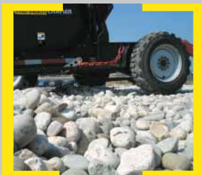
No counterweights on tires.