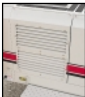
Main hydraulic system has separate cooler, hydraulically-driven fan. Cooler hydraulics — easier to maintain, longer lasting