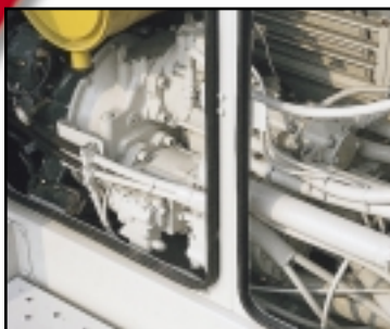
Big horsepower, high flows and plenty of reserve power to operate auxiliary hydraulic demands