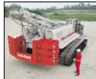
Seamless welds and treated hardware throughout attachment