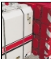
Optional hydraulic package has separate reservoir and cooling.