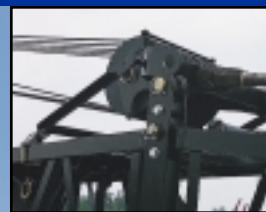
Fast attach bridle guide

Boom tip equipped with heavy duty 28" steel sheaves and comes standard with all connections for pile driving, jib and 5' tip extension.