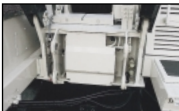
Hydraulic hook-ups — 3rd drum, spotter circuits, auxiliary tool