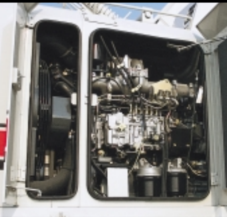
332 hp Mitsubishi engine