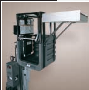
Molded Platform with Material Tray