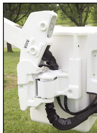
Boom Tip Covers

sales@altec.com Sales – 800-958-2555 Service – 877-GOALTEC