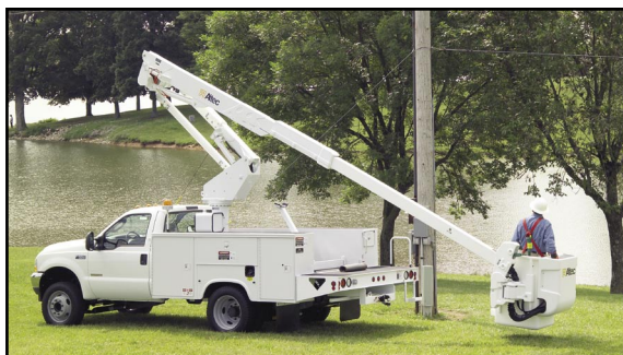
Easy Access From Ground

Altec Aerial Devices meet or exceed all applicable ANSI Standards as of the date of manufacture. Altec reserves the right to improve models and change specifications without notice or obligation.