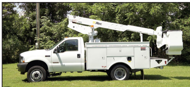
Stowed for Travel

Altec Aerial Devices meet or exceed all applicable ANSI Standards as of the date of manufacture. Altec reserves the right to improve models and change specifications without notice or obligation.