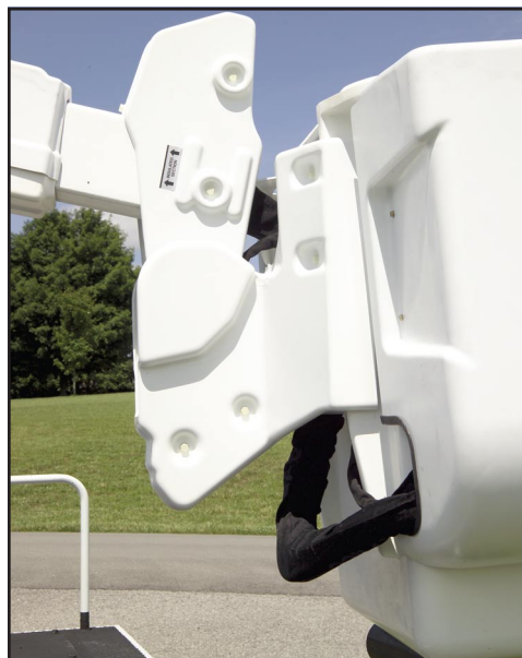
Boom Tip Covers