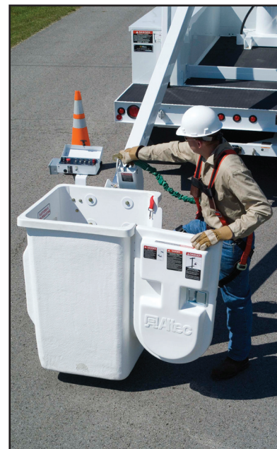
Easy Ground Access to the Platform