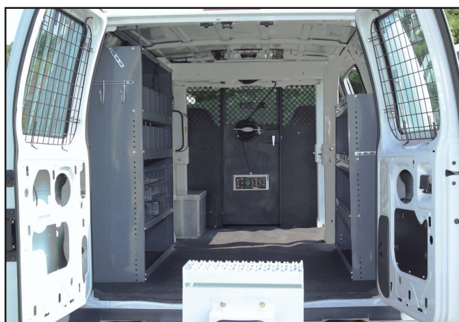
Optional Bridgemount Pedestal