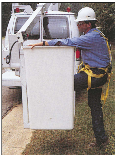
Easy Platform Access from the Ground

Altec Aerial Devices meet or exceed all applicable ANSI Standards as of the date of manufacture. Altec reserves the right to improve models and change specifications without notice or obligation.