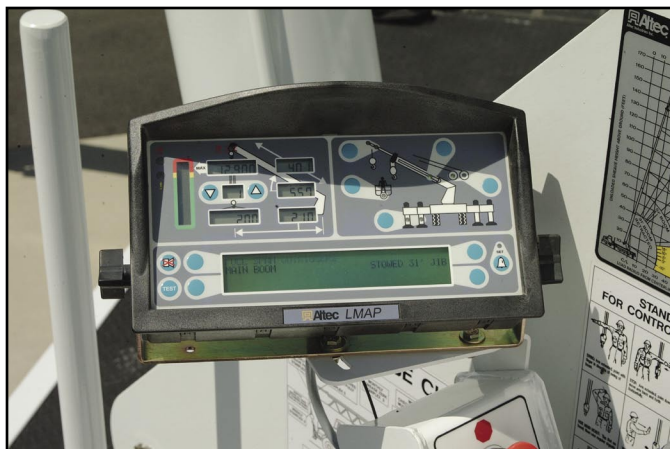
Altec LMAP System