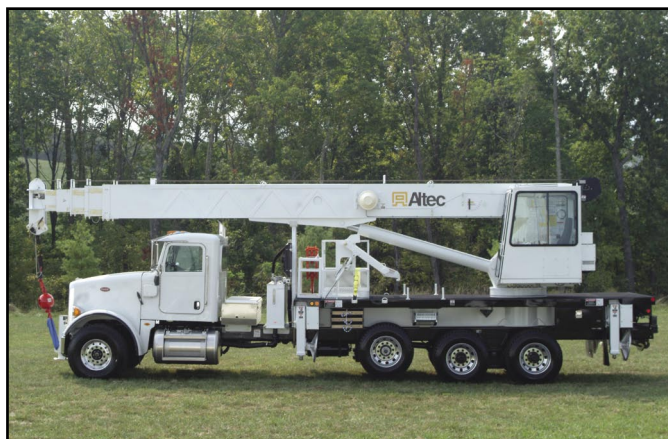
Vehicle Travel Height of 12.9 ft (3.9 m)

Ontario Service Center 831 Nipissing Road Milton, Ontario L9T 4Z4