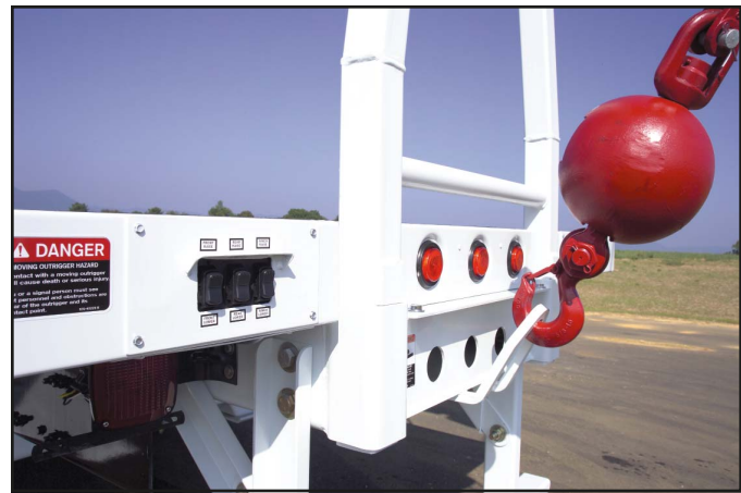
Easy Load Block Stowing